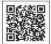
LEARN ABOUT THE AUTHORS OF OUR PARISH COMMUNITY

Our own obtuseness can block the Holy Spirit when we think we have all the answers. When I first preached in Honduras, in the village where I live, I was so prepared. I said everything I could think of, all that I had learned in my courses for a masters degree in divinity. But then, when I heard the prayers and insights of poor and simple folks, supported by a rich, personal knowledge of the Lord himself, I cut my sermons in half and let the "saints," as St. Paul liked to call the people, finish the job. Thank you, Holy Spirit! ●